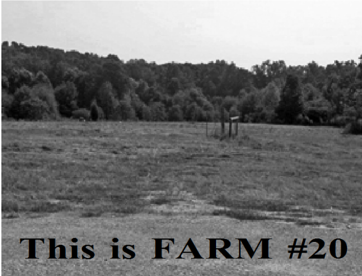
This is FARM #20

FROM GREENVILLE: Follow Interstate 385 SOUTH to Exit #19 (Gray Court/Laurens/Highway 14 exit). Exit and continue straight on Highway 14 for 1 & 8/10ths miles. Turn right onto Dials Church Road. Cross railroad tracks and then immediately turn left onto Old Laurens Road. Go 4/10ths mile and turn right onto Bob Gray Road. Go 3/10ths mile and turn left onto Carriage Farms Court. SEE SIGNS. DRIVE OUT ANYTIME!